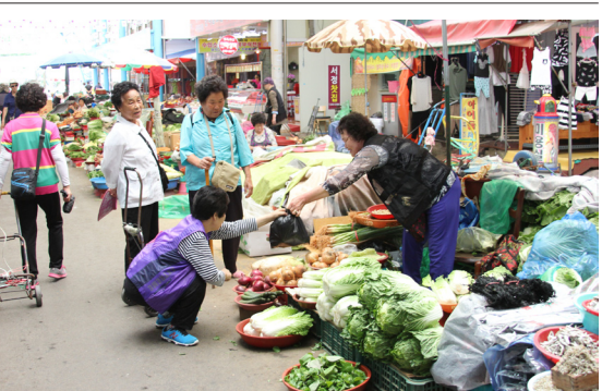
Food and special local products Yeosu Honey Bread, fermented skate, steamed pork, and kimchi with seafood <sup>|</sup> Semi-dried marine products, Yeosu leaf mustard kimch

Dolsan Park and Jasan Park with the first cable car system in Korea that cross the ocean are the tourist attractions that tourists always visit.