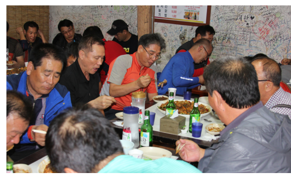
Food and special local products Andong chicken stew, cream cheese bread Andong salted mackerel, Andong soju Things to enjoy Art performance of Pyungryu Salon, Pyungryu Art Stage Surrounding tourist attractions Hahoe Folk Village, Dosan Seowon, Bongjeong Temple How to find 5 minutes walk from the Andong Station

Dosan Seowon is also the place where the image of proud in loneliness of Andong is well melted down. When you park your car and walk about 10 minutes along well paved walking track, antique traditional houses appear.