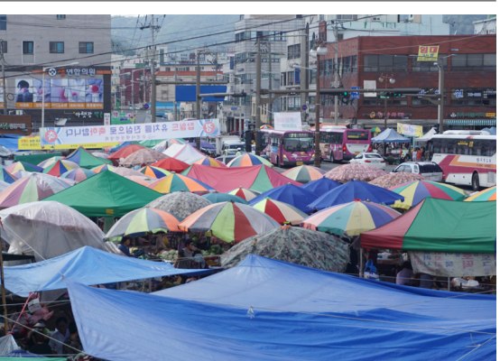
Food and special local products Gukbap alley, and food in night market Things to enjoy Night market which opens every Friday and Saturday Surrounding tourist attractions Suncheonman Bay and Namjegol Mural Village How to find 5-10 minute walk from Suncheon Terminal or KTX Suncheon Station