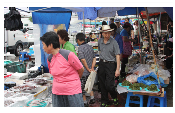
Food and special local products Ox head rice soup Kimchi Pancake | Squid The proceeded dasima product

Things to enjoy Bukpyeong Market Outdoor Place, Donghae Mooreung Festival Surrounding tourist attractions Attractions Mangsang Beach, Mukho Lighthhouse. Chuam Scrupture Park How to find 3 minutes from the Bukpyeona-dong Community Service Center on foot