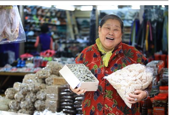
Food and special local products Chungmu-style Gimbap, Tongyeong Honey Bread | Lacquer inlaid with mother-of-pear. Traditional handcrafts Things to enjoy Wall Festival of East Cliff, Great Battle of Hansan Festival Surrounding tourist attractions East Cliff Wall Painting Village, Tongyeong Cable Car How to find 5km from Tongyoeong Bus Terminal, About 6,000 won by taxi

If you want special travels, 'island travels' to Bijin Island, Maemuldo, small Maemuldo which are boasted by Tongyeong are recommended. In Tongyeong Passenger Terminal located in 10- minute distance by walk from Tongyeong Jungang Market, passenger ships toward each islands are being operated throughout 3 times on weekdays and 3-6 times on weekend.