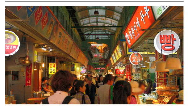
Food and special local products Hongdugge Noodle Soup, Gwangmyeong Grandmother's mung bean pancakes + Jangneungwang's grilled rib patties Things to enjoy One of the largest market in the whole country, various foods that you can buy at 1,000 won

Surrounding tourist attractions Gwangmyeong Tour Bus, Chunghyeon Museum, Gwangmyeong Upcycle Art Center How to find Exit 10, Gwangmyeongsageori Station, Seoul Subway Line 7