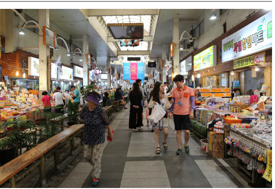
Food and special local products Clay pigs skewers, Mackerel Pike Gimbap Cutlass, Hallabong, Cheonhyehvang Things to enjoy Arang Joeul Street, Jeju Olle 6th course Surrounding tourist attractions Soesokkak, Chongbang Waterfall, Oedolgae How to find 1 hour 20 minutes from Jeju International Airport by passenger car

In addition, Omegi rice cake to which sweet bean is put on sufficiently can be tastes in 'Grandmother's Rice Cake House' having 30-year tradition, and pleasure of looking up famous restaurants hidden in every place of the market such as Mackerel Pike Gimbap' of 'Friendship Sashimi Center' is really pleased.