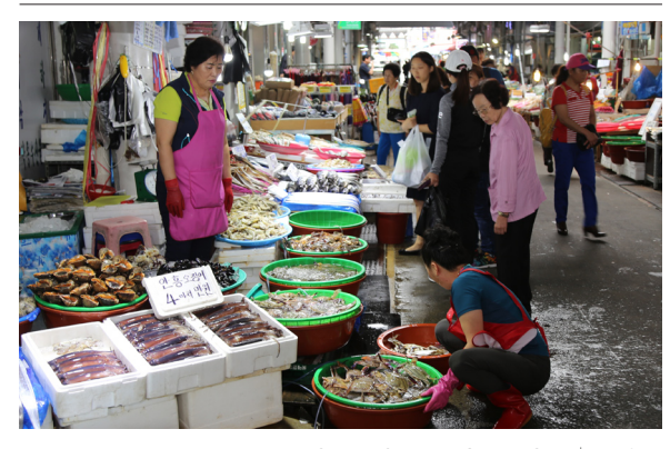
Food and special local products Gegukjii, Gourd and Octopus Soup | Rockfish ierky, Red garlic

Things to enjoy Market place cultural festival, Food night market Surrounding tourist attractions Haemieupseong, Seosan Lake Park How to find 15 minutes from the Seosan Bus Terminal on foot